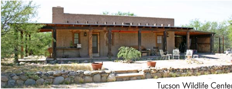
Tucson Wildlife Center