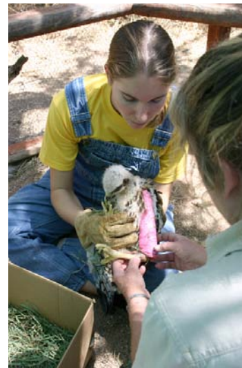
A volunteer holds a baby red-tailed hawk while a rehabber takes off a bandage. The hawk broke a leg when it fell out of its nest.

How do people become wildlife rehabbers? Many start as volunteers who learn how to care for animals in the homes and backyards of rehabbers with special wildlife training. Volunteers do not get paid for their work, but