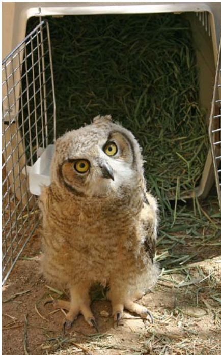
Topsy, a three-month-old female great horned owl, was rescued after she fell out of her nest during a windstorm. She is healing from neck and back injuries.

Many people don’t know what actions to take, or not to take, when they find wildlife that may be