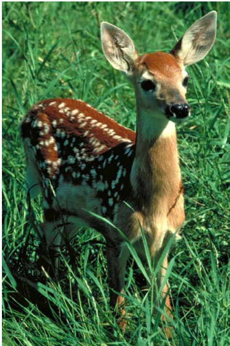
Unless baby animals are wounded, they do not need to be rescued.

People sometimes think they are rescuing baby rabbits, seals, and deer when these animals aren't in trouble. It's normal for babies of these species to rest quietly on a beach or in the grass while their mothers eat nearby. Only people trained in the natural ways of these animals know whether the babies need human assistance; if they don't, taking them from their mother hurts their chance of survival.