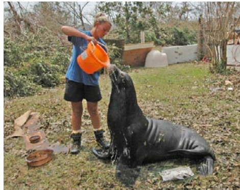
An animal caretaker pours water over Freebie, a sea lion washed into someone's backyard by Hurricane Katrina.

These wildlife rehabbers have special training in many areas. They are nutritionists with expertise in what and how much to feed different species of animals. They are behaviorists, meaning they have studied the behavior of wild animals and can understand and predict what a specific animal will do in various situations. They are animal-housing specialists who know exactly the type of cage, pen, or other enclosure to use for different species of animals, especially when an animal is injured and needs a particular kind of shelter to heal safely.