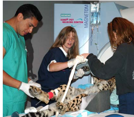
Veterinarians examine a cheetah.

clean place that had the right equipment and medicine to help you. Like you, wild animals deserve the best care available.