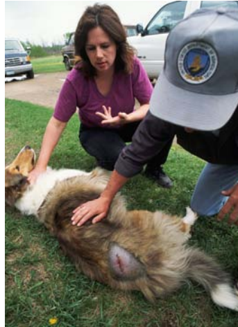
Animal rescuer and helper with an injured dog

If you encounter an animal that may need rescuing, always follow these two rules: 1) do not touch the animal , and 2) call an adult right away . Adults can help by calling a wildlife rehabber who is trained in wildlife rescue. You can help by watching from a safe place to see where an animal hides so that rescuers can find the animal when they arrive. Putting a box or laundry basket over an injured small animal will protect it from predators until help arrives.