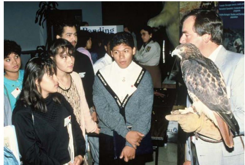
This bird of prey acts as an ambassador to teach children about animals in their area.

Wildlife rehabbers do important work in caring for injured wild animals and returning many of them to the wild. You can help rehabbers' efforts by respecting wildlife and by calling a rehabber if you see an animal in distress. One phone call might give a wild animal the opportunity to grow up and live a free and healthy life.