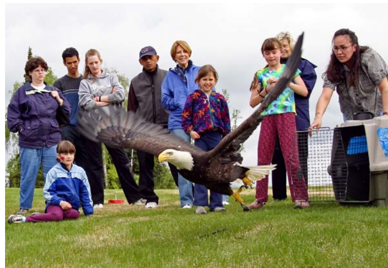
A wildlife rehabber has some company as she lets this bald eagle fly.

Slow release is often used with young animals, especially orphans. Rehabbers put a pen in a safe place in the wild with the door left open so that the animal can return to it. Rehabbers provide food for the animal until it is clear that the animal can find food for itself. Fast release is often used with wild animals rescued as adults. These animals already know how to live on their own in nature. They are taken to a release location, ideally near where they were found, and are let go.