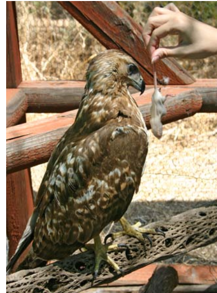
A volunteer feeds a mouse to an adult red-tailed hawk that is almost completely blind.

Baby animals imprint on their mothers at an early age; a baby duck learns that it is a duck by watching its mother every day. Wildlife rehabbers take special care not to let baby birds imprint on people; otherwise, the babies will grow up thinking they are human and will seek out humans instead of their own kind. Raptors, or birds of prey, and other birds that have imprinted on people may become dangerous in the wild. They may seek attention from a hiker who doesn't know they are used to human contact. The hiker or the bird could get hurt in the meeting. For this reason, the birds often cannot go back to the wild.