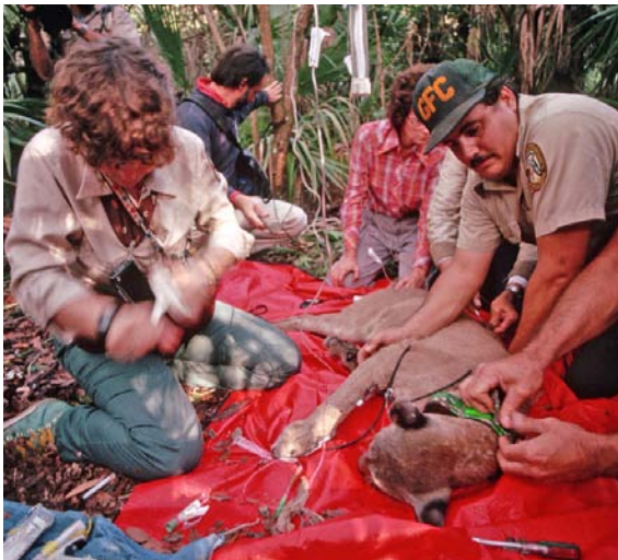
Florida state wildlife workers give a panther medicine so that it can get well.

Most wildlife rehabbers work with animals that are indigenous , or native to the region where the rehabbers work and live. They have special permits and licenses to treat these animals. To work with exotic animals, which are non-native animals that have migrated or been brought to the region, a rehabber requires special training with those animals as well as special licenses and permits.