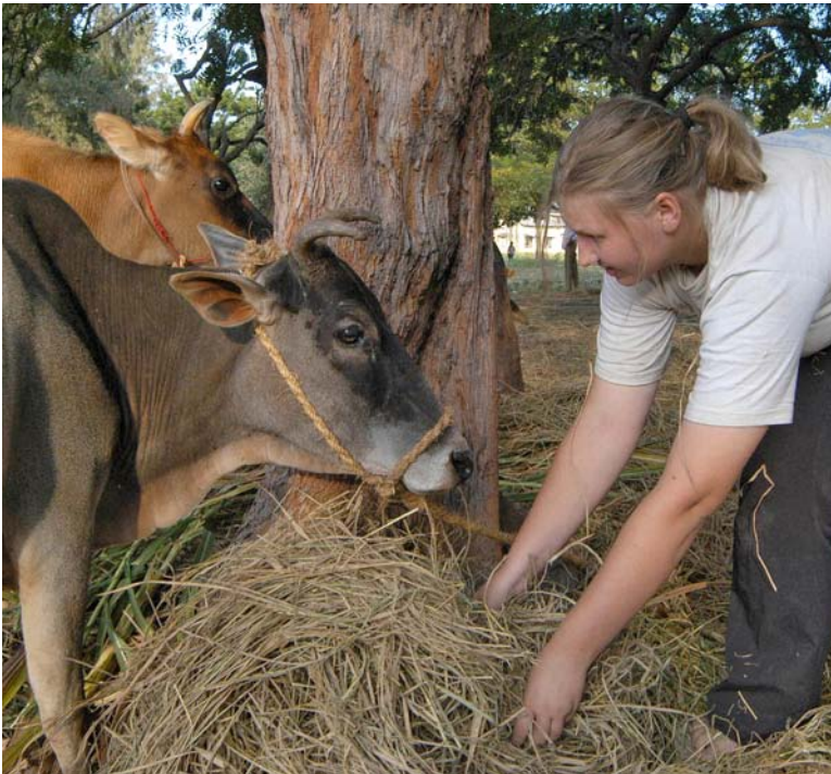
A volunteer feeds cattle in a part of India hit hard by the tsunami of December 2004.

Incredibly, many wild animals knew to run inland before the 2004 Asian tsunami hit land; however, pets and farm animals did not fare so well. Several people in the areas hit by the tsunami depended on working farm animals; many of these animals were killed, injured, or left in devastated areas without food. The Humane Society International worked with other organizations and volunteers to help the animals—and the people who cared for them—get their lives back on track.