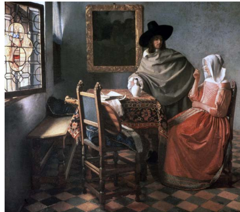
Vermeer's painting, Lady and Gentleman Drinking Wine , shows the clothing and furniture of wealthier people when Vermeer lived.

Han knew a great deal about art and life during the years that Vermeer was painting. He was a smart man, and he knew that a convincing art forgery required many things. The subjects of the painting had to look as if they were from the time period when Vermeer lived. The paint and canvas also had to appear old. But most of all, his painting technique had to reflect Vermeer's style.