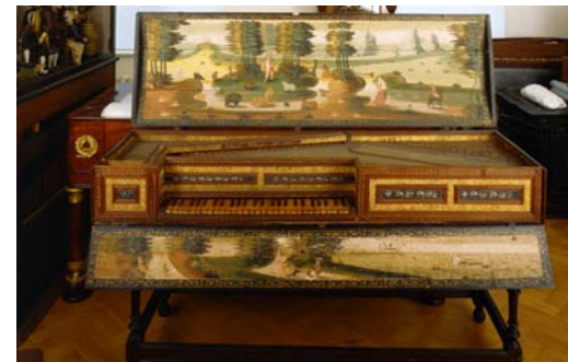
This 1661 virginal is an instrument similar to a modern piano.

In 1993, a man came to a famous art house with a painting called A Young Woman Seated at the Virginal . He wondered whether it was a real Vermeer, or whether perhaps the famous