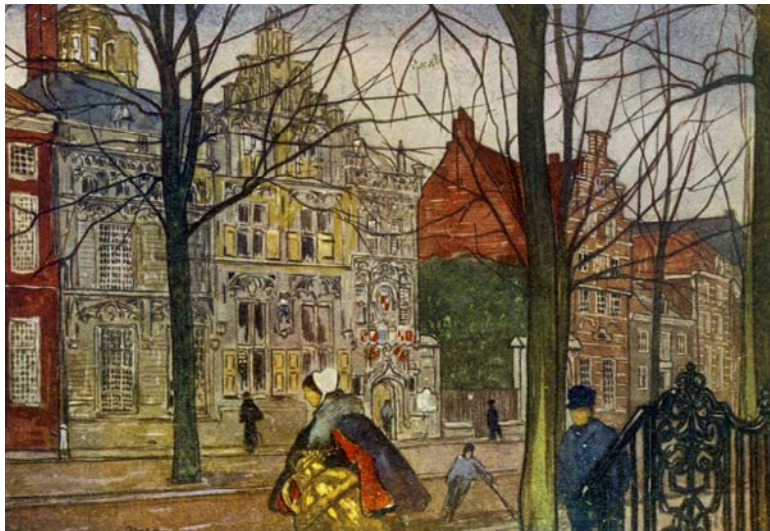
These scenes of Delft in 1904 show buildings Han might have studied as an architecture student.