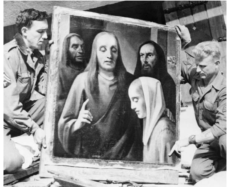
This forgery in the style of Vermeer is the one that got Han caught.

Vermeer’s style and technique took Han many years to master. Vermeer was a genius at using light. In his paintings, light often comes through a window and shines on tiny details.