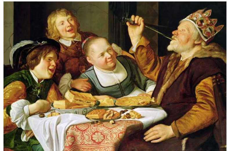
These paintings from the Dutch Golden Age show some of the techniques that inspired Han's work.

As time went by, Han did not work as hard, and many critics did not like his work. They said his work followed the old masters too closely. They said he had no talent . The bad reviews that these critics wrote about Han made him sad and very angry.