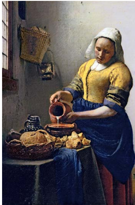
Vermeer's The Milkmaid shows a servant in humble clothes.

would have to learn a lot about life during that time. For instance, he would have to know how people dressed and wore their hair.