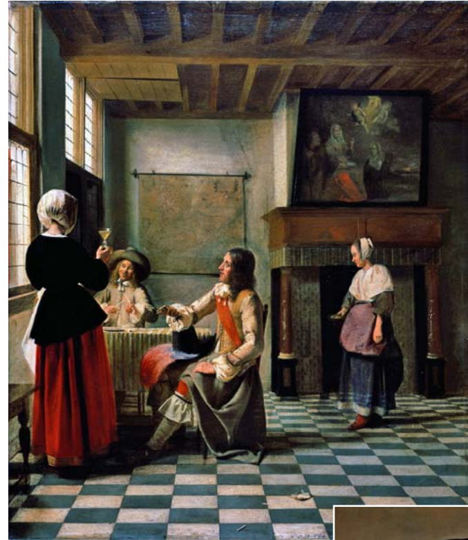
Works by Pieter de Hooch (above) and Frans Hals (right)—Han forged paintings by both.