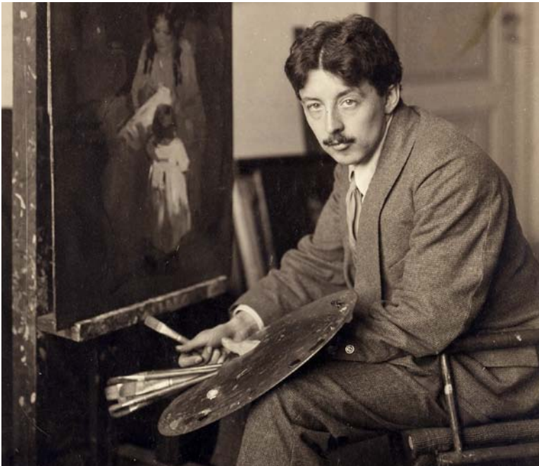
Artist Han Van Meegeren became rich by forging paintings based on masters from the Dutch Golden Age.

Han planned to tell the critics he had painted the picture but decided against it. Han was a greedy man, and he had been paid much more than he expected. So he decided to paint more forgeries and get very, very rich.