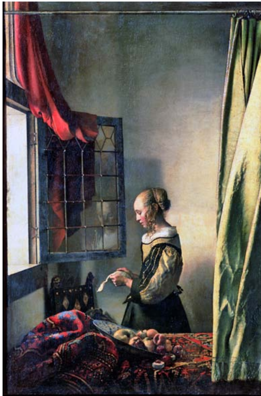
Vermeer's Girl at the Window Reading a Letter

Johannes Vermeer used light brilliantly. His colors were soft and gentle, and he chose them to create a mood or show a moment in time. He enjoyed painting the people he saw around him every day. He was a genius at expressing their feelings. What feelings do you see in Vermeer's paintings?