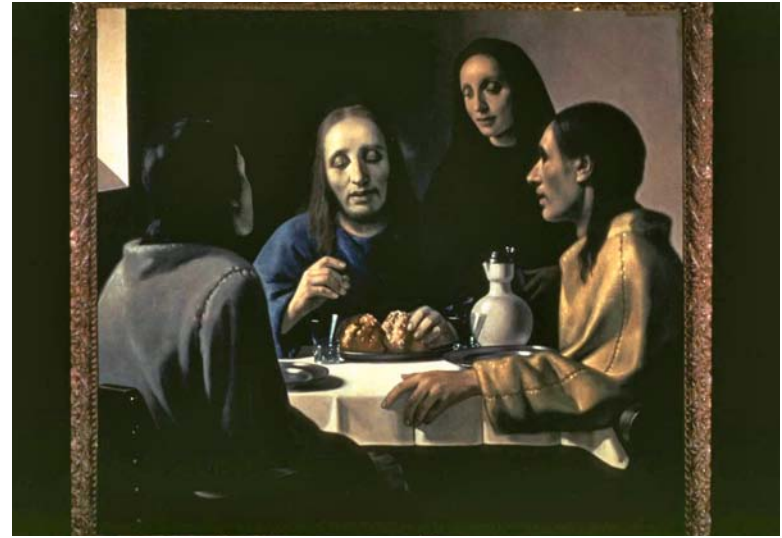
The Disciples at Emmaus shows details that point to Vermeer as its painter, but it is the work of forger Han Van Meegeren.

Han also chose his paints and brushes very carefully, using only brushes and colors identical to those used by Vermeer. Sometimes, he ground and created his own paints when he needed blues that were only made a certain way 200 years before. Also, since paints take many, many years to harden, he probably added a chemical to his paints to make them dry quickly. He also added a varnish that made the entire painting appear a bit old and dusty.