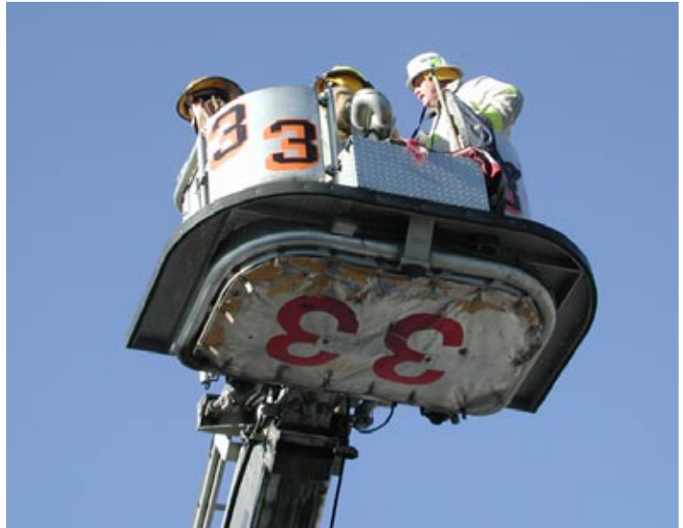
Firefighters ride high in bucket ladders.

Firefighters go to firefighting school. They learn about different kinds of fires.