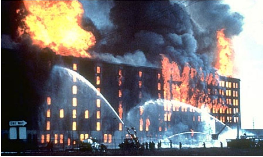
Firefighters try to put out a fire in a large factory.