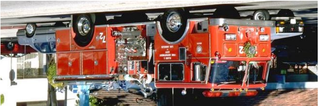
A fire truck races to a fire.