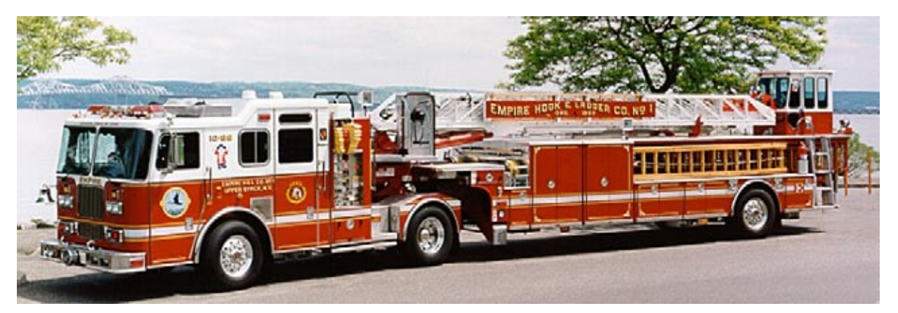
Ladder trucks have steering wheels in the front and back.