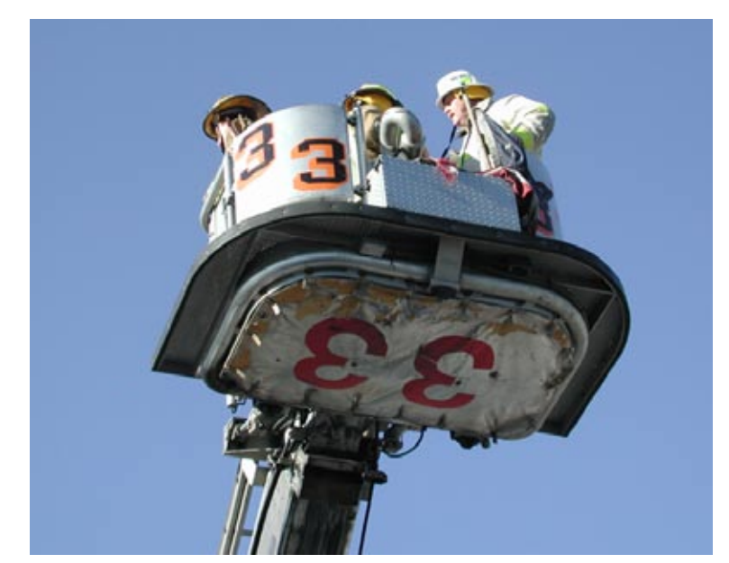
Firefighters ride high in bucket ladders.

Firefighters go to firefighting school. They learn about different kinds of fires.