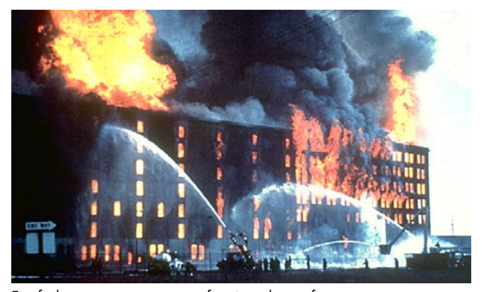
Firefighters try to put out a fire in a large factory.