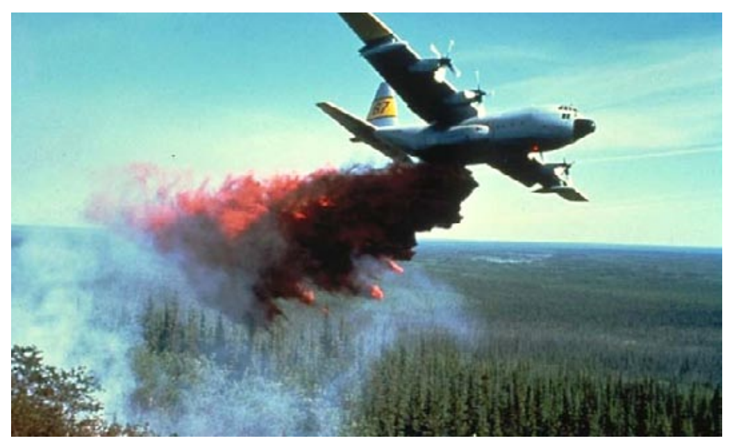
A plane dumps chemicals on a forest fire.

Helicopters drop water on fires. Large planes help put out forest fires.