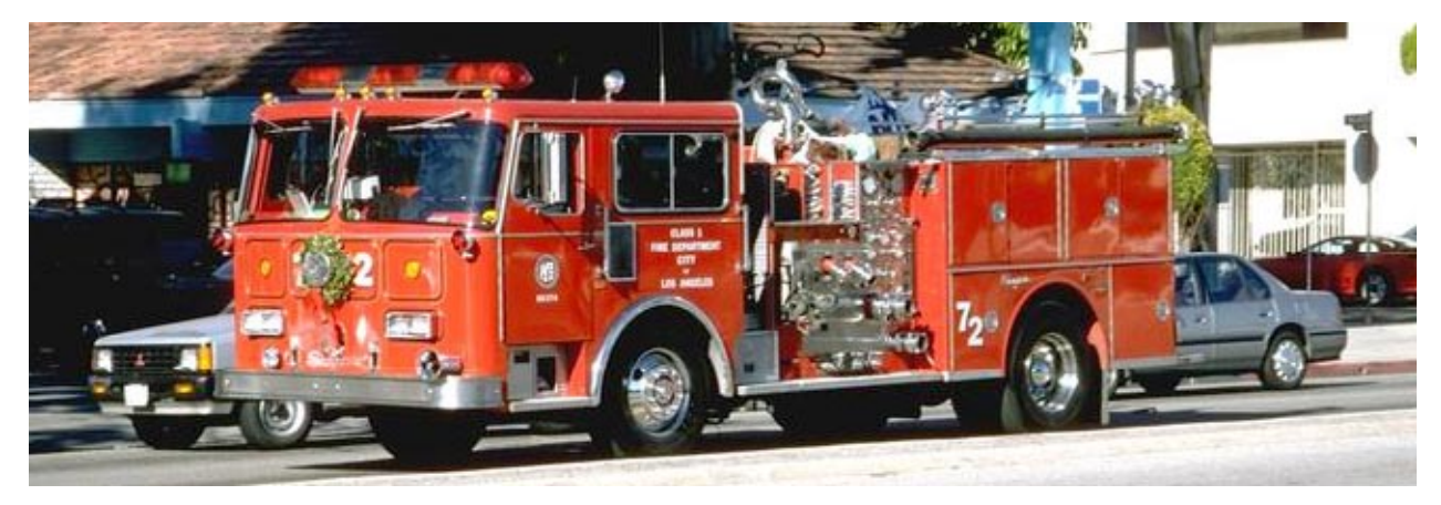
A fire truck races to a fire.