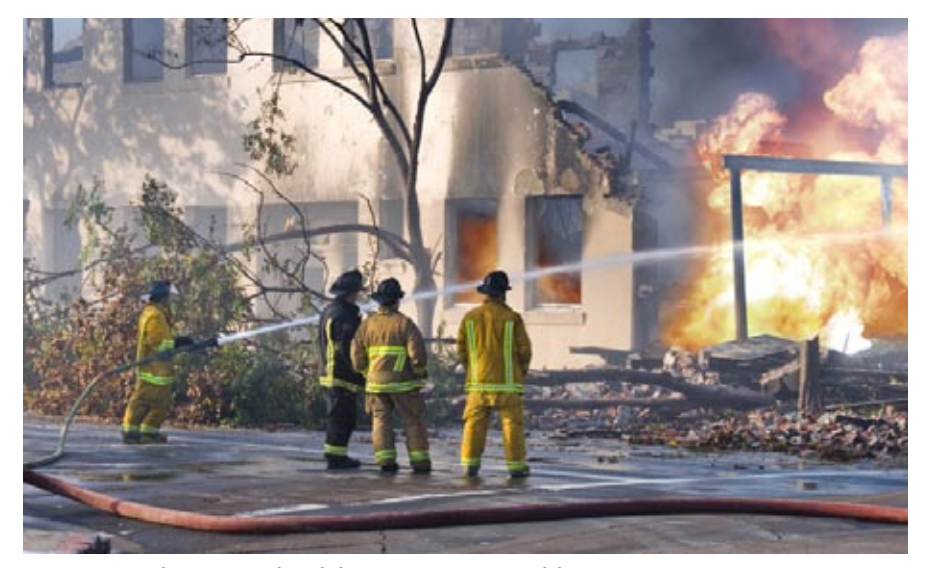
Fire can damage buildings very quickly.