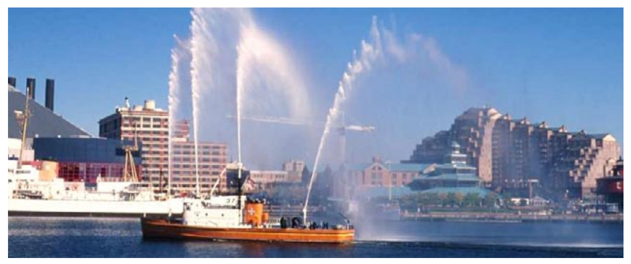
Fireboats can spray seawater.

There are other kinds of firefighting machines, too. Fireboats fight fires from the water.